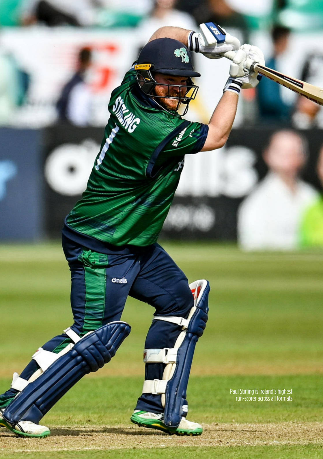
Paul Stirling is Ireland's highest run-scorer across all formats